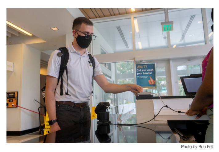
Faculty and staff members can dine at campus dining locations and receive a discount when using Faculty/Staff Dining Funds.

Tech Dining has partnered with PJ's Coffee in New Orleans to create a signature blend of coffee exclusively available at Georgia Tech. Called Burdell's Brew, the rich, flavorful blend is