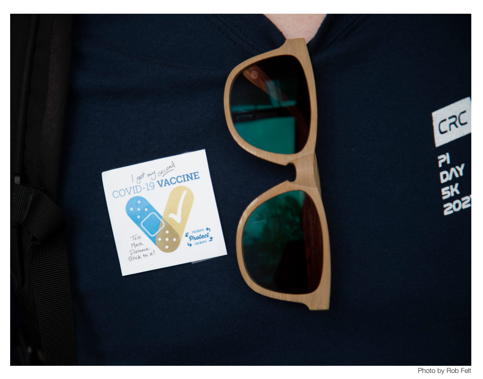
Covid-19 vaccines are still available on campus for all faculty, staff, and students, as well as their family members ages 12 and older. Vaccine clinics will take place at McCamish Pavilion every day this week.

The Centers for Disease Control and Prevention (CDC) recently issued new interim guidance recommending the use of masks inside public buildings, even by fully vaccinated individuals, as a precaution given the broad circula-